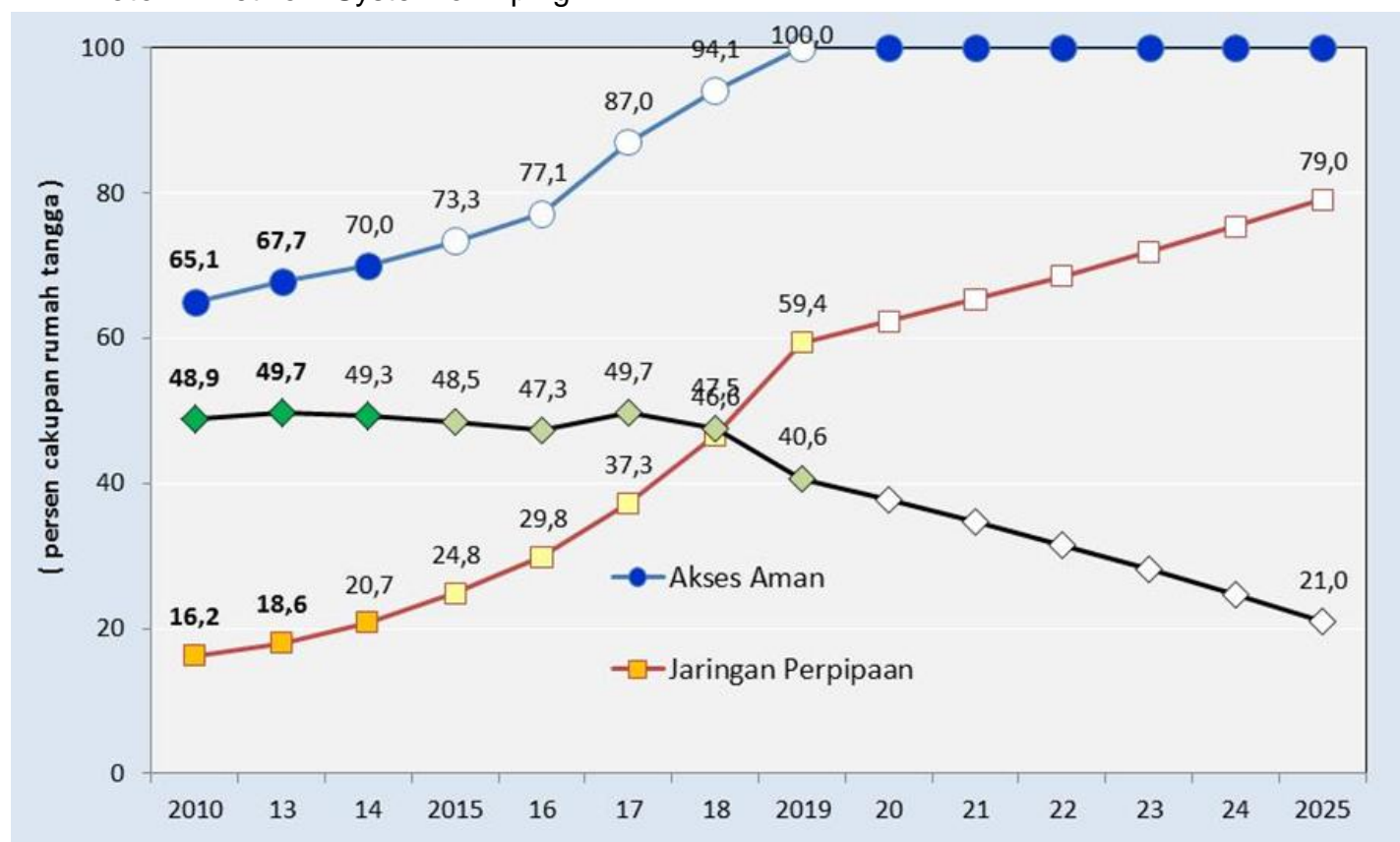
Note 1 - Network System of Piping